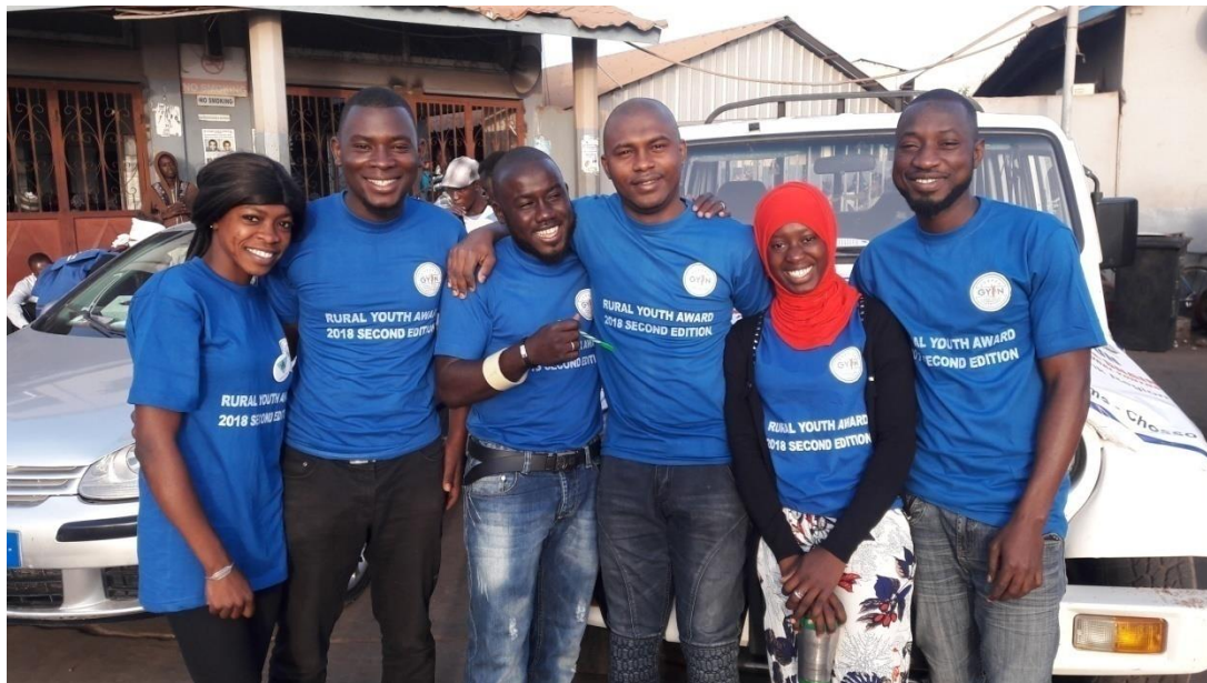
Caravan team in NBR distributing Award forms

On Tuesday, 22 nd March, 2018, the National Organizing Committee embarked on a nationwide tour to the underprivileged and to the remote part of the country to meet the local administrative authorities including youth leaders and groups to enlighten them on the Award application forms.